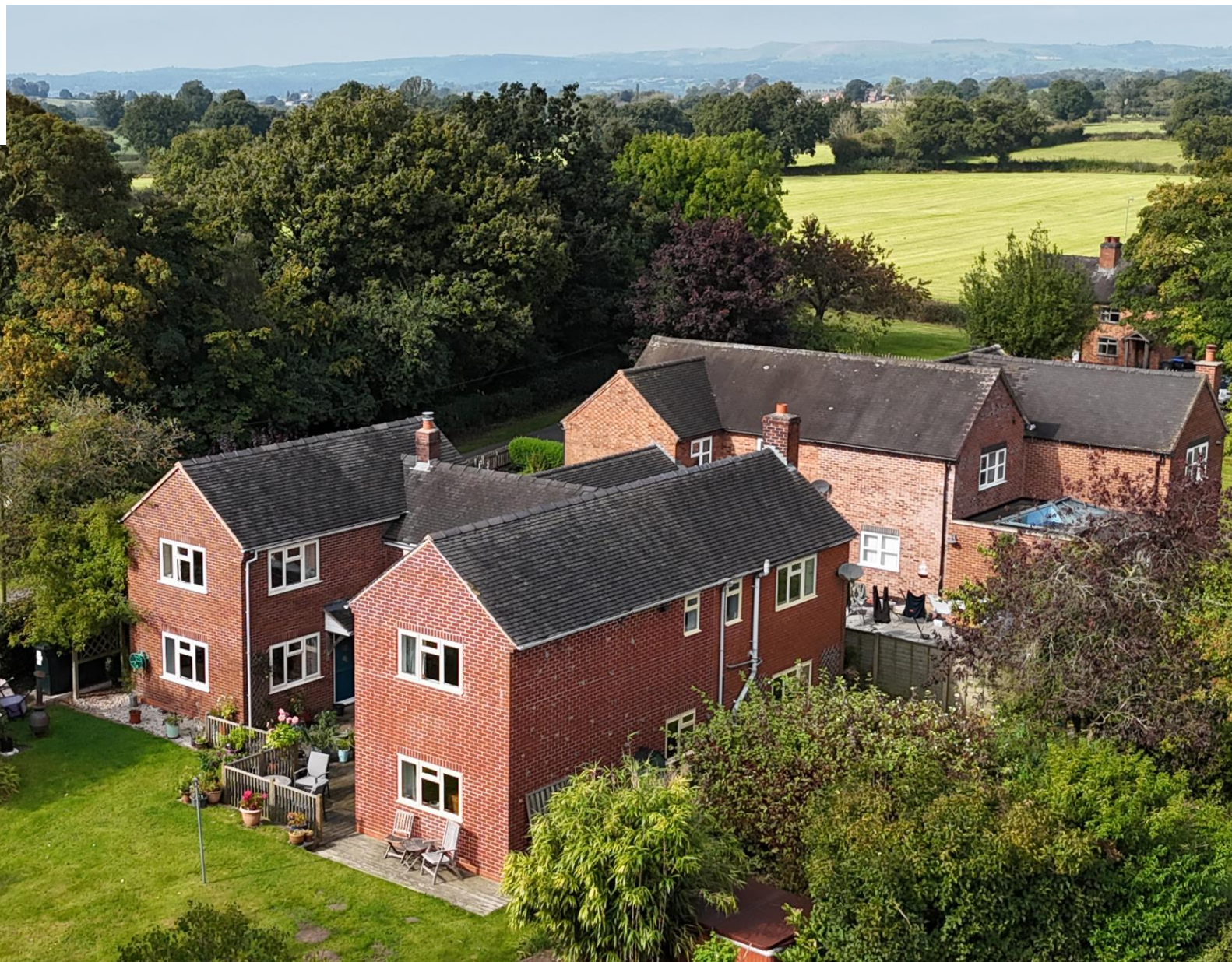
BOWLING ALLEY COTTAGE BOWLING ALLEY LANE MARSTON MONTGOMERY DE6 2FE