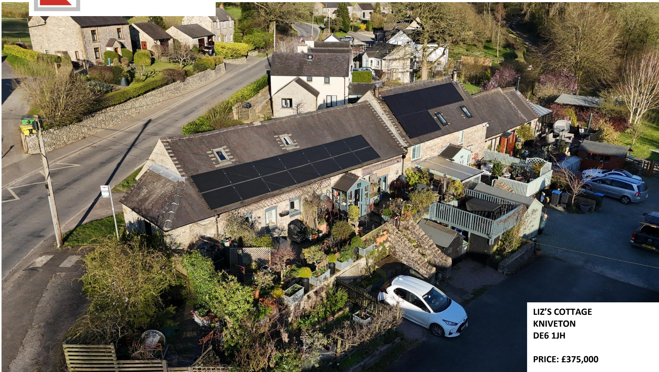
LIZ'S COTTAGE KNIVETON DE6 1JH