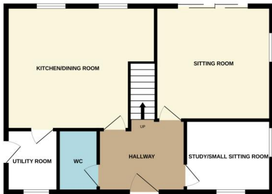
GROUND FLOOR 648 sq.ft. (60.2 sq.m.) approx.