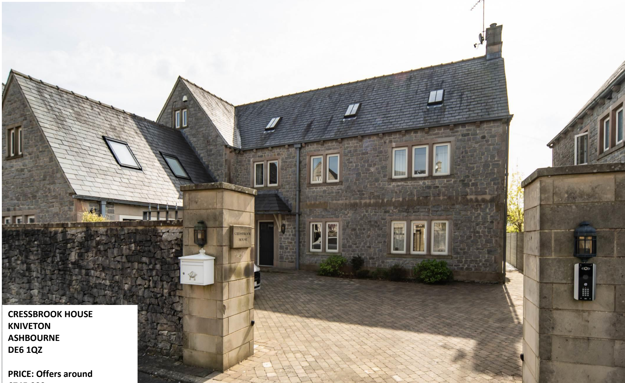
CRESSBROOK HOUSE KNIVETON ASHBOURNE DE6 1QZ