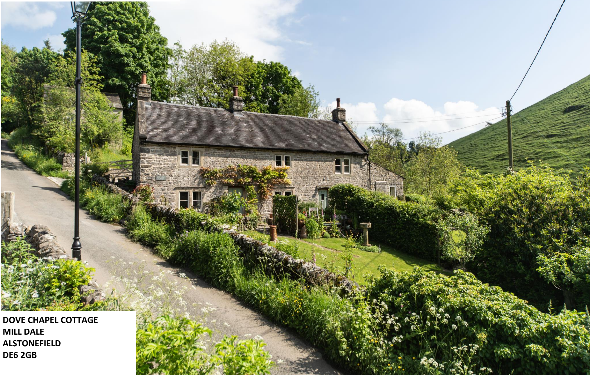
DOVE CHAPEL COTTAGE MILL DALE ALSTONEFIELD DE6 2GB